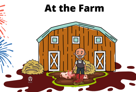
At the Farm