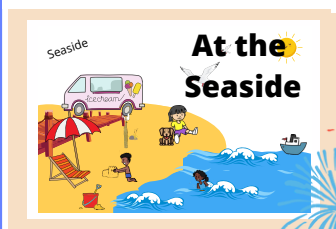
At the Seaside

In this unit children will develop their expressive movement through the topic of 'places'. Children explore space and how to use space safely. They explore traveling actions, shapes and balances. Children choose their own actions in response to a stimulus. They also are given the opportunity to copy, repeat and remember actions. They continue to use counting to help them keep in time with the music. They explore dance through the world around them. They perform to others and begin to provide simple feedback.