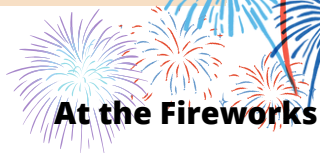
At the Fireworks